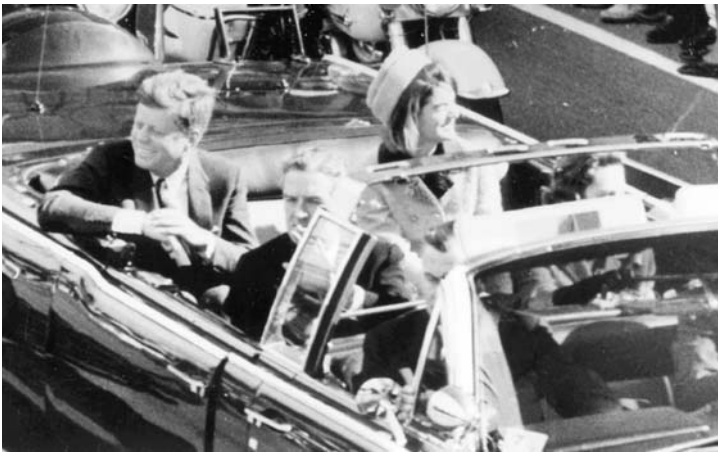
FIGURE 4.4. Mad Men relies on the viewer's associations with this photograph of the Kennedy motorcade.

was born Richard “Dick” Whitman, has styled himself as “Don Draper,” so has Don mastered the ability to style products in a way that satisfies his clients and increases their revenue. One could even say that Don is a designer of his own mise-en-scene (his clothing, hair style, walk, the spaces in which he chooses to live and work, and so on), but, of course, Weiner and his crew and cast have actually constructed the mise-en-scene for both Draper and Mad Men .