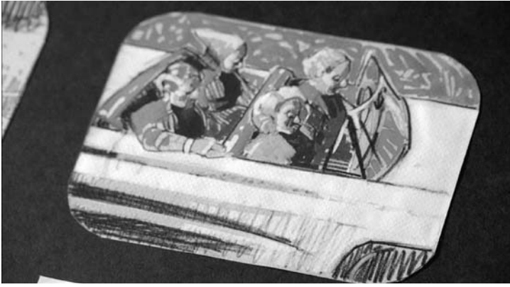
FIGURE 4.3. Don nixes the plan for a hairspray commercial after seeing a storyboard that evokes widely circulated photos of the convertible in which President Kennedy was shot.