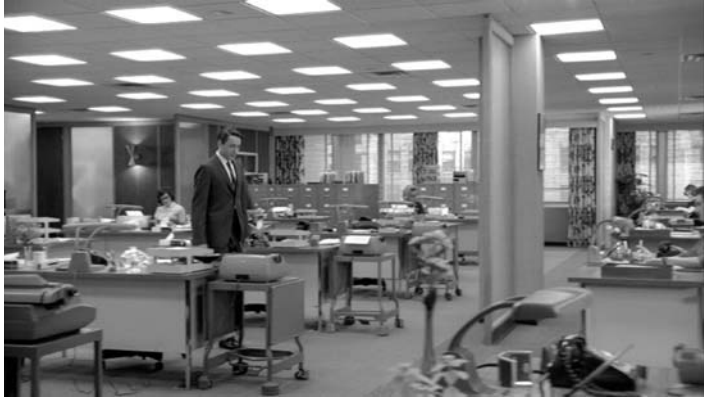
FIGURE 4.1. The rigid power structure of the ad agency is visually manifested in the office spaces of Mad Men .

she gets her own office, and in the layout of the new Sterling Cooper Draper Pryce (SCDP) agency, she scores a prestigious one next to Don Draper's. However, the SCDP offices are not nearly as commodious as Sterling Cooper's. Contrasted with the wide-open space of Sterling Cooper's office, SCDP's diminished space visually echoes the diminished fortunes of the ad men as they struggle to start a new agency.