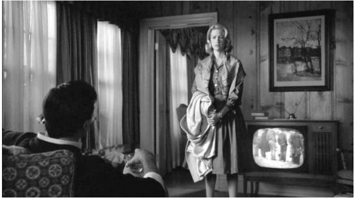
FIGURE 4.2. Mad Men's detailed mise-en-scene just barely contains the emotional upheaval below the surface of mid-century Ameri- can "normalcy."

live television, she screams and exclaims, “What is going on?!” Motivated by the television violence she has witnessed and the collapse of her privileged world, she eventually leaves the house to meet Henry Francis, and he proposes to her. Thus, the television, an element of mise-en-scene, evolves in this episode from seemingly insignificant set dressing to major narrative catalyst, blending the personal crises of the characters with larger moments in American history.