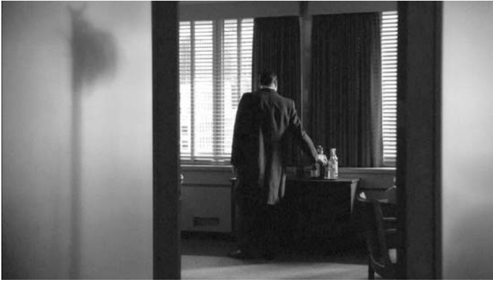
FIGURE 4.5. Cinematography is used throughout Mad Men to build mood and add to characterization rather than to mimic the visual style of the multicamera dramas of the day.

this short walk, he looks directly at her, but she does not return his gaze. The camera movement comes to a rest from nobody's point of view, showing Betty, Don, and the kids; she looks straight ahead, and he and the children look at each other. The camera stays objective for four medium shots, with the fourth shot offering a subtle bit of camera work. Bobby looks at Sally, and when she turns around to look at Betty, the camera pulls focus from him to her—a distance of just a few feet. In terms of narrative motivation and the emotional rhythm of the scene, Sally needs to be sharply in focus as it is her look that motivates the next cut to Betty in a low-angle subjective shot where she looks back toward Sally and the camera. The scene concludes with a camera angle very close to the earlier one from Don's point of view, showing the entire kitchen as he sends one more unreturned look in Betty's direction before leaving.